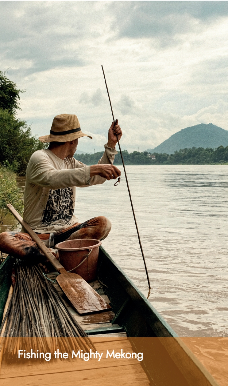
Fishing the Mighty Mekong